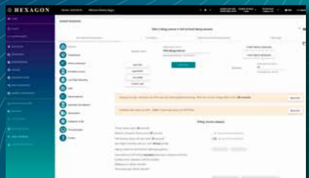
Debug Session triggered on events or on demand Data collection directly usable by Nasdaq Calypso Technical support