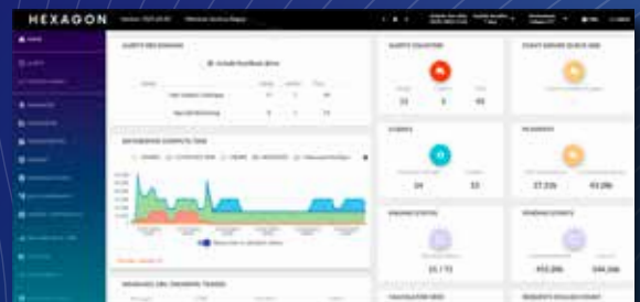
Calypso global health Multi environment monitoring Live mode & up to one year of historical data